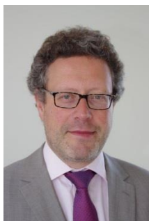
Head of Unit Cybersecurity & Digital Privacy, DG Connect European Commission

Head of Unit 'Cybersecurity and Digital Privacy' within the European Commission in Brussels (Directorate-General Communication Networks, Content and Technology). Among others involved in the negotiations of recently adopted NIS directive, implementation of the EU cyber-security strategy's actions on resilience, industrial measures and Research and Innovation under H2020, and cooperation with the EU Agency for Network and Information Security (ENISA).