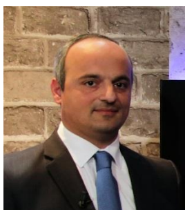
Head ISCD - Information Security and Compliance Department Information Security and Compliance Department – Malta Information Technology Agency (MITA)